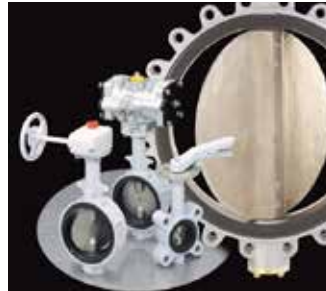
Ductile Iron Butterfly Valves