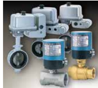
Electric Actuated Valves