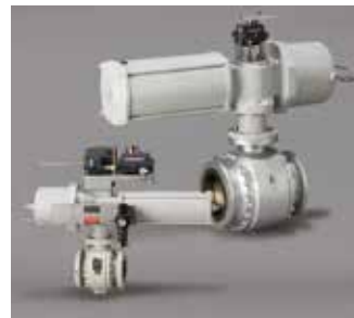
Trunnion Mounted Ball Valves