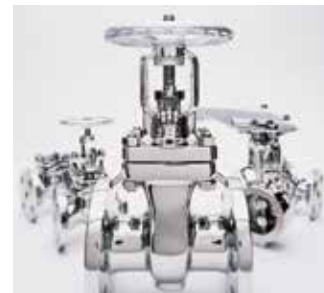
Duplex Stainless Steel Valves