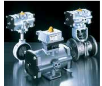
Pneumatic Actuated Valves