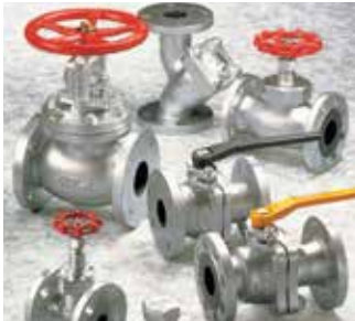
Ductile Iron Valves